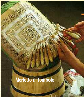
Merletto al tombolo